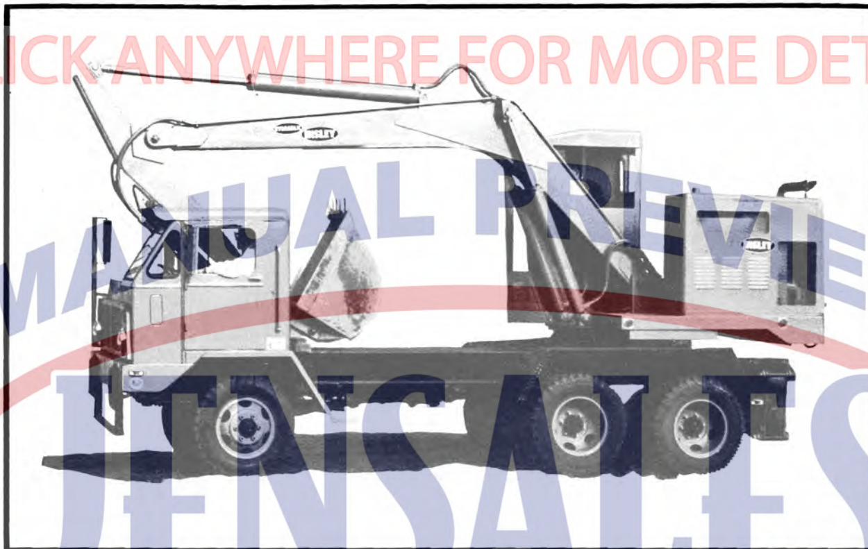
TYPE H - TRUCK MOUNTED, LEFT-SIDE