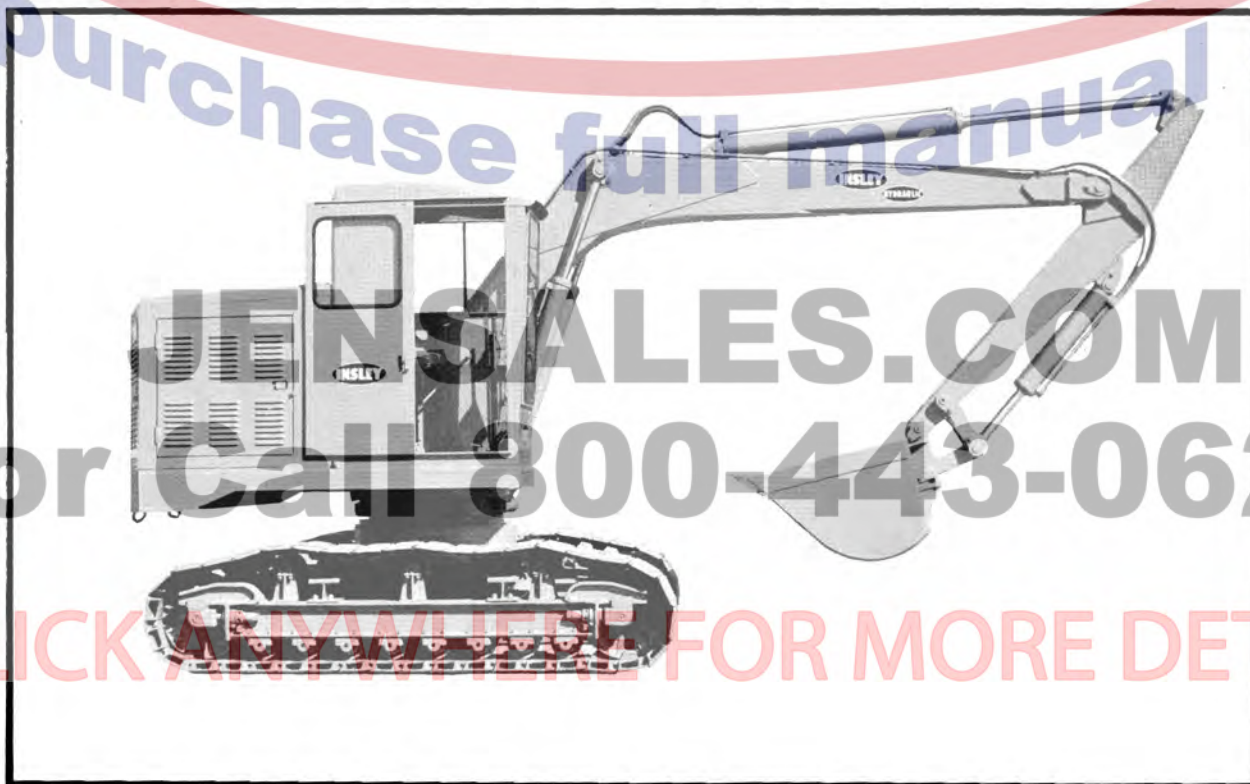
TYPE H - CRAWLER MOUNTED, RIGHT-SIDE